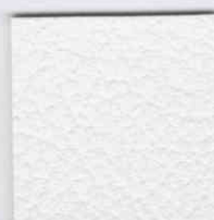
107-9607 PURE WHITE