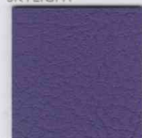
107-2118 ULTRA VIOLET