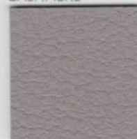
107-4044 WARM GREY